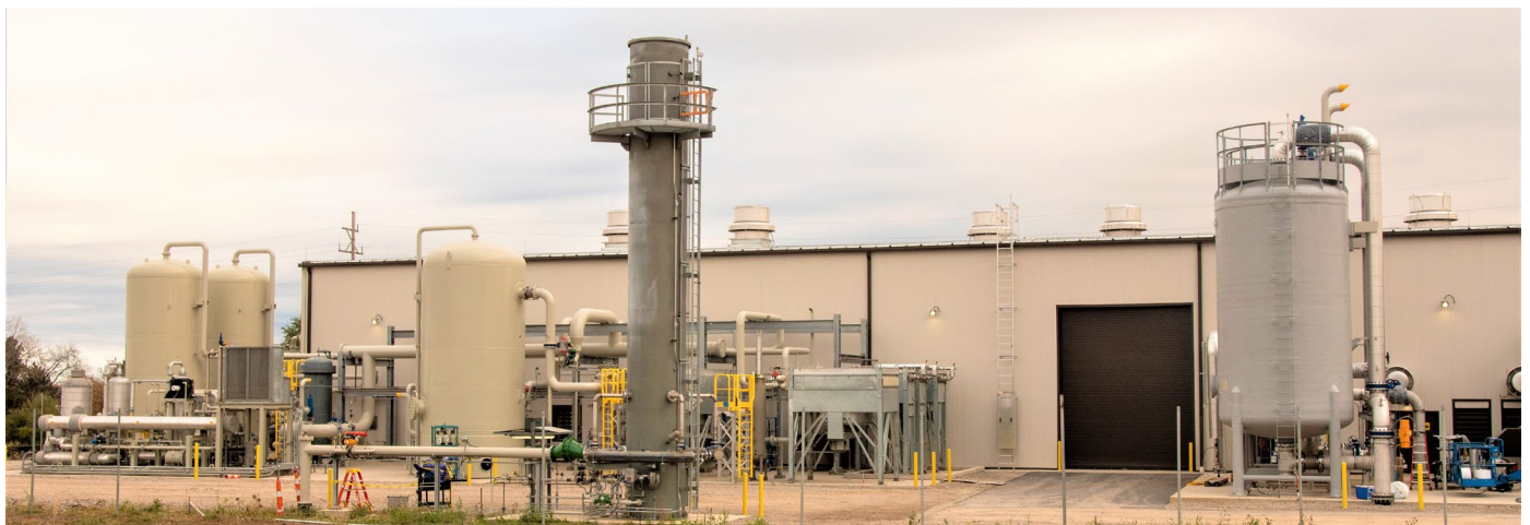
EDL's Wood Road RNG Facility

EDL owns and operates a global portfolio of RNG facilities and power stations in North America, Australia and Europe.