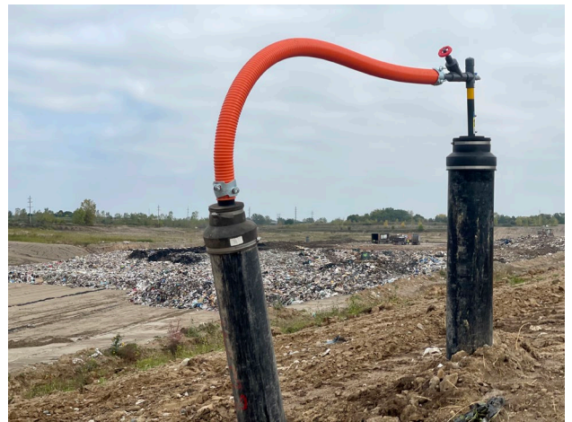
RNG will be created from waste gases from Granger Waste Services' Wood Street Landfill