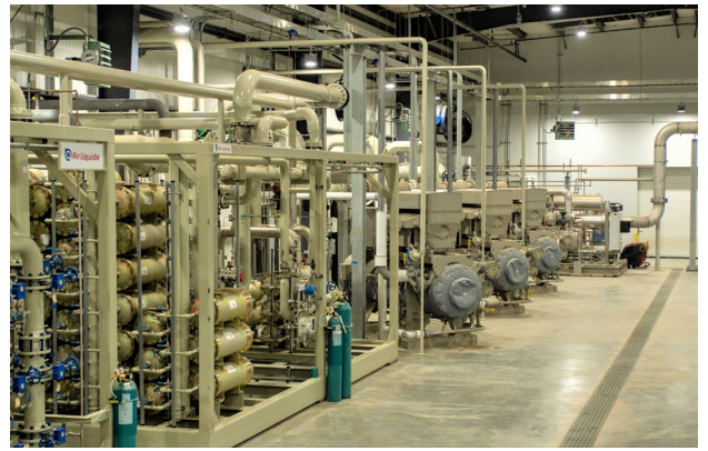
EDL's Wood Road RNG Facility will produce 870,000 mmBtu of pipeline-quality RNG each year

The RNG produced at the Wood Road RNG Facility will be added to Consumers Energy's existing pipeline network for delivery to end users. A portion will be taken by bp to supply natural gas-powered vehicles across the United States. The RNG will also be delivered for residential, commercial, and industrial use in North America.